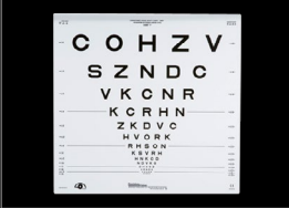
Sight testing & refraction equipment