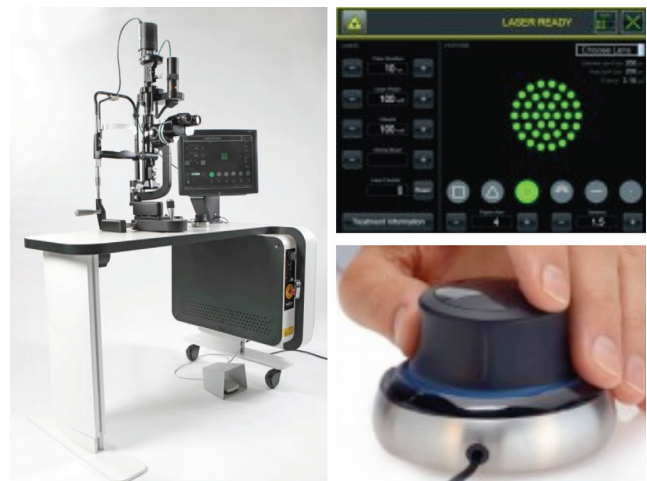
Figure 2. Valon laser instrument, screen and joystick

In a randomized, prospective study of 101 patients undergoing peripheral laser photocoagulation for various reasons, Röckl and Blum 14 applied conventional single spot laser therapy in 35 patients (group A) and MSL therapy using the Visulas 532s VITE in 66 patients (group B). Spot size was consistent between the two groups (300 µm), while pulse duration was 100-150 ms for group A versus 20 ms for group B. Laser power was adjusted to produce moderate burns and the treatment time was recorded. After the procedure, patients were asked to rate their pain from 0 (painless) to 10 (maximum pain). Treatment time was shorter in group B than in group A. In group A, 46% of the patients