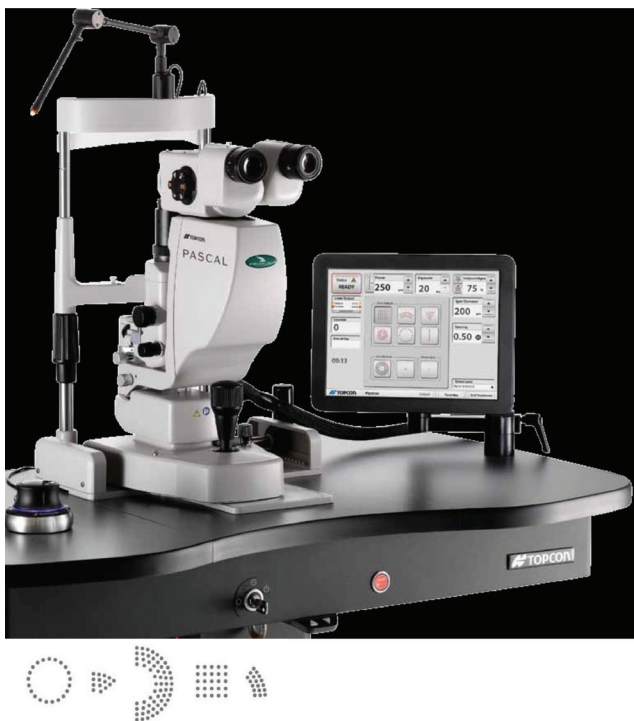
Figure 1. The PASCAL 532 nm instrument and panel showing available treatment patterns

As with the PASCAL, the spot number within a pattern can be adjusted from 1 to 36 depending on the pattern type and spot size. Valon’s most important feature, not shared by the PASCAL, is that the settings chosen with the joystick are displayed over the retinal image. This feature eliminates the need for physicians to look away from the microscope while making adjustments, thus saving time spent to focus back on the retina. Spot sizes of 50, 100, 200 or 300 µm can be selected from the microscope.