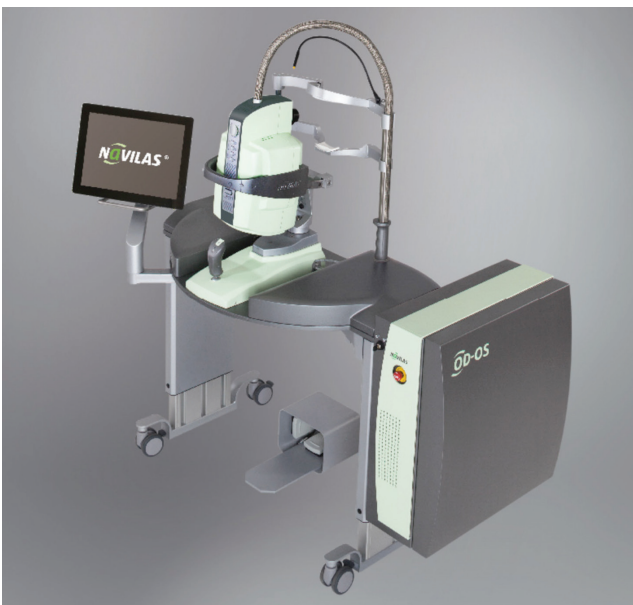
Figure 4. The Navilas system with integrated fundus camera